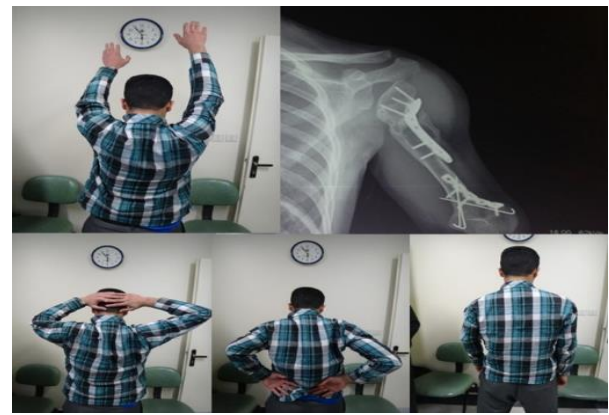
Figure 5. Postoperative photography and radiography

This report indicates that open valgus osteotomy can be used as an influence treatment for varus deformity of proximal humerus. Bone union was achieved in both patients in three months (Figure 5). At five years follow up, abduction and flexion improved to 140 and 160 in the first patient and 160 and 180 in the second patient. There was no pain or any sign of impingement in our patients. Both of them were satisfied with the improvement of their function and cosmesis.