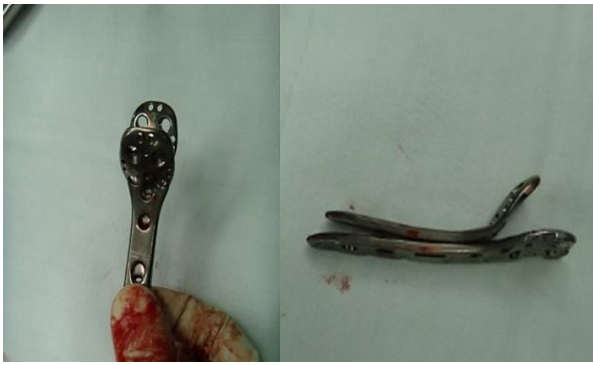
Figure 3. Bending of the Philos plate

The plate was bent as much as the preoperative plan determined (Figure 3). It was 60 degrees in the first patient and 50 degrees in the second patient. The plate was fixed on the same place by passing the pins through plate's holes, and fixed it with previous screws and with one or two additional screws at the proximal part.