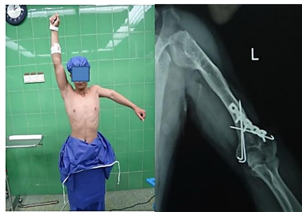
Figure 1. Preoperative photograph and radiography in patient 1

hospital, she had a 5-cm shortening of the humerus. The range of motions of the shoulder were 90, 100, 30, and 40 degrees of abduction, flexion, and external and internal rotation, respectively. Antero-posterior radiography showed 90 degrees of neck-shaft angle.