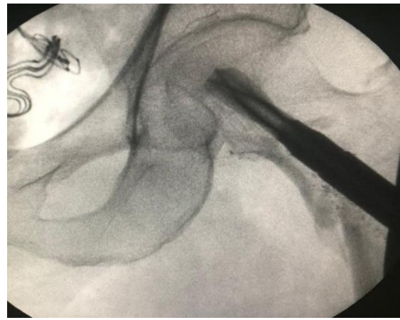
Figure 4. Intraoperative imaging of the left hip after removing the broken guide wire

Finally, according to the urologist's advice, 600 cc of normal saline was injected into the urine catheter to rule out iatrogenic bladder injury during the procedure.