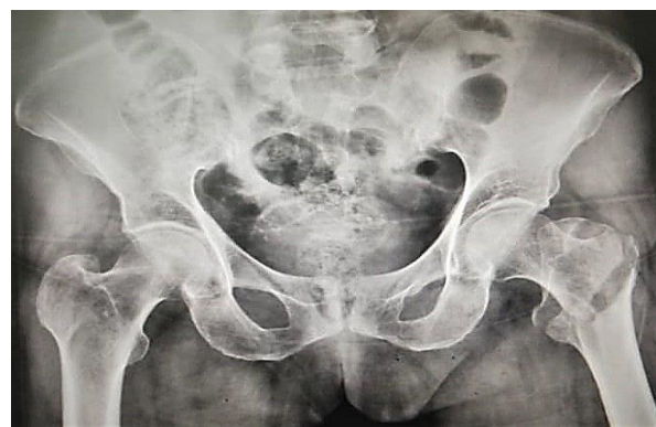
Figure 1. Preoperative radiograph of the left hip with intertrochanteric fracture [AO Foundation and Orthopedic Trauma Association (AO/OTA) type 31-A2]

An 83-year-old female was admitted to the orthopedic ward with intertrochanteric fracture caused by falling. The patient's weight and height were 56 kg and 170 cm, respectively [body mass index (BMI): 19.3 kg/m 2 ]. Her past medical history was unremarkable except for osteoporosis. On radiographic assessments, the fracture pattern was compatible with type 31-A2 AO Foundation and Orthopedic Trauma Association (AO/OTA) fracture classification (Figure 1).