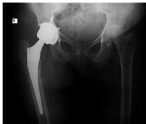
Figure 1. Pelvic X-ray [Anteroposterior (AP) view] after the first surgery showing degenerative changes in the left hip

Radiographic study of the hip was in favour of degenerative arthritis with joint space narrowing, subchondral sclerosis and cyst formation. Other findings were osteophyte formation and degenerative changes in the lumbar spine and bilateral sacroiliac joints (Figure 1). Primarily, she was treated with conservative management using analgesics and physical rehabilitation. A total hip arthroplasty by posterior approach was performed when she had progressive pain and limited ROM.