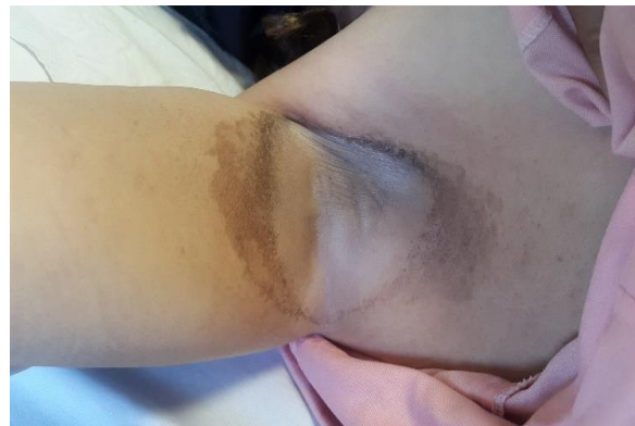
Figure 4. Pigmentation of the axillary region

After the surgery, the patient was examined carefully for other signs of the disease. At this time, multiple pigmentations were found in the axillary region (Figure 4). We retrospectively reviewed the documentation of the first surgery and found no relevant findings even in the pathology report.