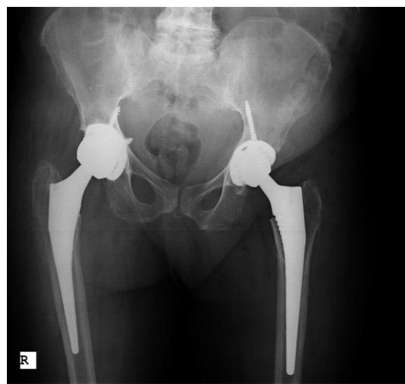
Figure 5. Follow-up pelvic X-ray [Anteroposterior (AP) view]

Her pain was significantly decreased after the surgery. In the latest follow-up, 20 months after the second surgery, the ROM was acceptable in both hips without any pain or discomfort. The radiologic studies showed no further pathological findings in femoral or acetabular components (Figure 5).