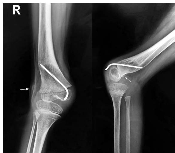
Figure 3. Anteroposterior (AP) and lateral radiographs of the right knee at the time the patient was referred for a second opinion. The first surgeon added a distal femoral varus component to the patient's deformity to improve the clinical knee valgus. Arrows point to the patella, which is now ossified and is visible along with a faint shadow of the patellar tendon.

On the latest radiographs, the patellae were ossified bilaterally, albeit hypoplastic and dislocated (Figure 3).