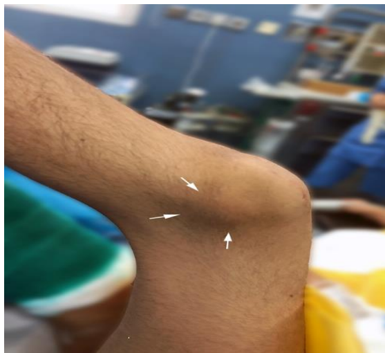
Figure 1. Left knee before the second surgery. The foot is to the left. Flexion contracture of the knee is evident. Arrows point to the hypoplastic patella, which is irreducibly dislocated.

On physical examination, the patellae were laterally displaced, irreducible, and hypoplastic. Active knee extension was weak, and the flexion contracture of the knees was appreciable bilaterally (Figure 1).