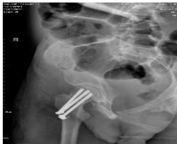
Figure 2. The postoperative radiograph of our patient showing closed reduction and internal fixation (CRIF) by three cannulated screws

According to this protocol, the recommended treatment for a patient would be internal fixation if it is a displaced fracture in a patient under 40 years old without comorbidities. The postoperative radiograph is seen in figure 2.