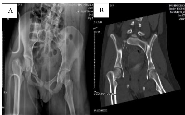
Figure 1. A 19-year-old woman with right femoral neck fracture; pelvic anteroposterior (AP) x-ray (A), computed tomography (CT) scan (B)

A 19-year-old woman came to our clinic with a femoral neck fracture (Figure 1). What is your stepwise approach to choose the appropriate treatment, i.e., internal fixation or arthroplasty?