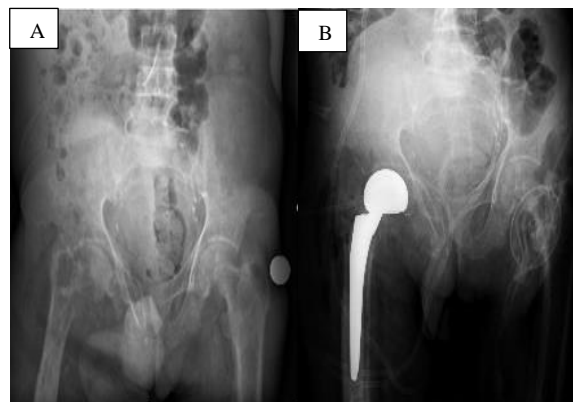
Figure 4. Preoperative (A) and postoperative (B) radiographs of a 65-year-old patient with right femoral neck fracture who had end-stage renal disease (ESRD) and severe osteoporosis

Figure 4 shows a case of femoral neck fracture in a 65-year-old man with severe osteoporosis and ESRD who came to our clinic. As the fracture was displaced and the patient was over 60 years old, the treatment of choice would be arthroplasty according to the criteria mentioned above. Due to the presence of comorbidities, we performed cemented HA.