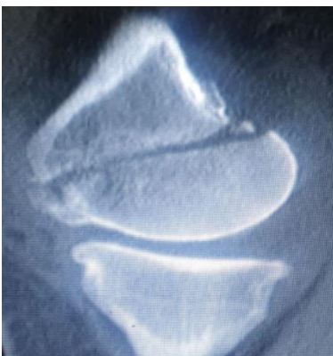
Figure 5. Sagittal view cut of computed tomography (CT) scan showing unusual fracture pattern similar to Salter-Harris type III fracture in children

Distal femoral fractures are relatively common injuries with a bimodal pattern of distribution.