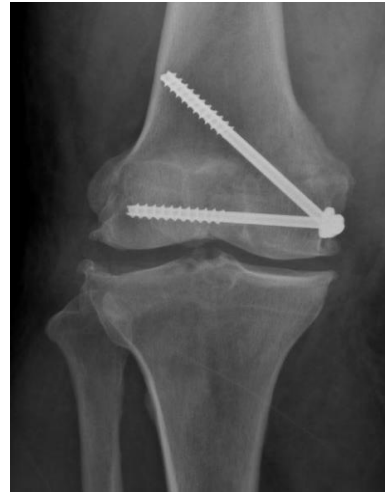
Figure 6. Post-operative anteroposterior (AP) x-ray of the patient's knee showing anatomically-reduced fracture fixed with two 7.3 mm cannulated screws

Although low-energy injuries are common among the elderly with this fracture, high-energy injuries are not uncommon in the elderly with distal femoral fractures (3).