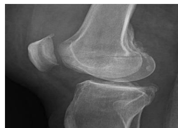
Figure 2. Lateral x-ray of the knee joint showing distal femoral fracture

Post-operative and follow-up radiographs were satisfactory (Figures 6 and 7).