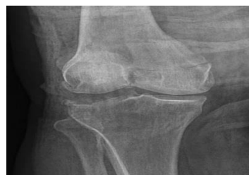
Figure 1. Anteroposterior (AP) x-ray of the knee joint showing distal femoral fracture

two 7.3mm partial-threaded cannulated screws. Reduction was anatomic on multiple projections.