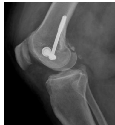
Figure 7. Post-operative lateral x-ray of the patient's knee showing anatomically-reduced fracture fixed with two 7.3 mm cannulated screws

The rich musculature of the area leads to various fracture and deformity patterns. However, as a rule of thumb, quadriceps tends to shorten, adductors and iliotibial band (ITB) cause varus and valgus, respectively, and gastrocnemius may cause a posterior apex deformity at the fracture level (1, 4, 5).