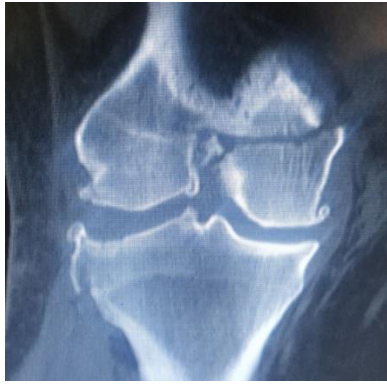
Figure 3. Coronal view cut of computed tomography (CT) scan showing unusual fracture pattern similar to Salter-Harris type III fracture in children

There was also a tibial plateau lateral side depression fracture which was less than 1 cm. Early range of motion (ROM) was initiated. Toe-touch weight-bearing was started after a week and full weight-bearing was allowed after 8 weeks. At 3 rd month post-surgery, the patient walked cane-free and returned to his previous level of activity.