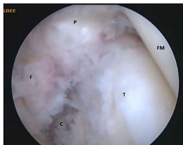
Figure 3. Arthroscopic view from the high posteromedial (PM) portal showing the displaced posterior cruciate ligament (PCL) tibial avulsion fracture (P: PCL; F: PCL tibial avulsed fragment; C: Fracture crater; FM: Medial femoral condyle; T: Medial tibial condyle)

The synovium between the anterior cruciate ligament (ACL) and PCL was removed using a motorized shaver to create a window lateral to the PCL into the posteromedial (PM) compartment. Similarly, the synovium between the PCL and the medial femoral condyle was removed to create a window medial to the PCL into the PM compartment. The scope was progressed into the PM compartment through the medial window, and two PM portals were established using the out-to-in needle technique – a high PM viewing portal was made 3 cm above the PM tibial joint line, and a low PM working portal was made at the level of the PM joint line. A 5.5-mm cannula was placed in the low PM portal. The arthroscope was then shifted into the high PM portal (Figure 3). A PCL elevator (Acufex, Smith, and Nephew - a manufacturing company) was introduced from the AM portal into the posterior compartment through the lateral window. It was placed posterior to the PCL to protect the neurovascular structures. A motorized shaver, introduced through the low PM portal, and the PCL elevator were used to remove the synovium in the posterior compartment in relation to the PCL. The PCL, the PCL tibial bony avulsion fragment, and the fracture bed were identified. The status of the PCL was confirmed. The fracture bed was debrided using a motorized shaver and burr. An arthroscopic probe was used to provisionally reduce the fragment into the fracture bed.