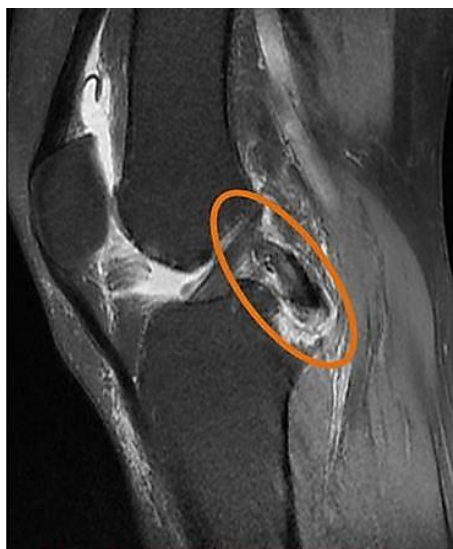
Figure 2. Magnetic resonance imaging (MRI) showing posterior cruciate ligament (PCL) tibial bony avulsion fracture with intact PCL (orange circle)

Pre-operative data recording included age, sex, side, mechanism of injury, duration since the injury, and complaints with respect to pain, locking, clicking, sensation of giving away, and swelling. Clinical examination included tenderness, range of motion (ROM), McMurray's test, and tests for instability (these are the tests used to demonstrate the sensation of the knee twisting or moving from side to side when doing basic activities) (14-16). Lysholm Knee Score was recorded pre-operatively (17-19). Radiological investigations included X-rays and MRI of the knee.