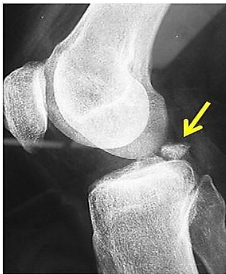
Figure 1. Lateral X-ray showing displaced posterior cruciate ligament (PCL) tibial bony avulsion fracture (yellow arrow)

Pre-operative data recording included age, sex, side, mechanism of injury, duration since the injury, and complaints with respect to pain, locking, clicking, sensation of giving away, and swelling. Clinical examination included tenderness, range of motion (ROM), McMurray's test, and tests for instability (these are the tests used to demonstrate the sensation of the knee twisting or moving from side to side when doing basic activities) (14-16). Lysholm Knee Score was recorded pre-operatively (17-19). Radiological investigations included X-rays and MRI of the knee.