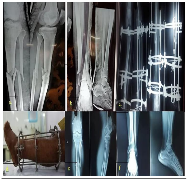
Figure 3. 24-year-old man, Melis type II close fracture, Ilizarov fixator application; a and b: Pre-operative X-ray; c and d: Post-operative clinical picture and X-ray; e and f: Bony union at proximal fracture site at 21 weeks and distal site at 23 weeks

Patients were allowed to bear complete weight (supplemented with crutches/walker) on the second day of surgery with no weight-bearing restrictions (Figure 4). The patients were evaluated at 2-week intervals for the initial 2 months and then followed up at 4-week intervals. Follow-up radiographs were used to assess alignment, bone contact, and callus formation. The minimum time to follow-up was 12 months (range: 12-18).