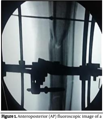
Figure 1. Anteroposterior (AP) fluoroscopic image of a type IV segmental tibial fracture; the fragment reduced with the help of olive wire used as drop wire.

The Ilizarov fixator was aimed to achieve distraction between reference wires with compression at fracture sites while maintaining the alignment between all the fragments. It was prepared with 3 blocks and 3 working lengths. The proximal fragment was fixed with wires perpendicular to the axis of the long bone and the distal fragment was fixed with the wires parallel to the ankle joint. The axis of the distal metaphysis was then aligned with the axis of the proximal fragment. In the lateral fluoroscopic view, the metaphyseal fragments were also rotated into axial alignment. Once proximal and distal blocks were aligned, they were stabilized, and the segmental fragment was then reduced to the proximal and distal blocks. In some cases, the technique of opposed olive wires was used to reduce the segmental fragment (Figures 1-3). Care of the pin track site involved betadine solution followed by pressure dressing.