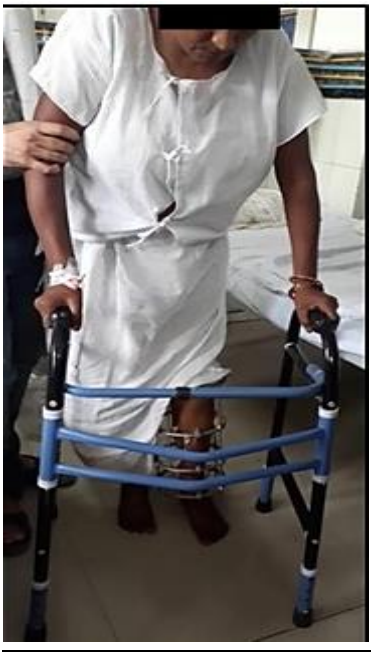
Figure 4. 45-year-old women, Melis type III close fracture, patient taking partial weight-bearing on the second day after surgery