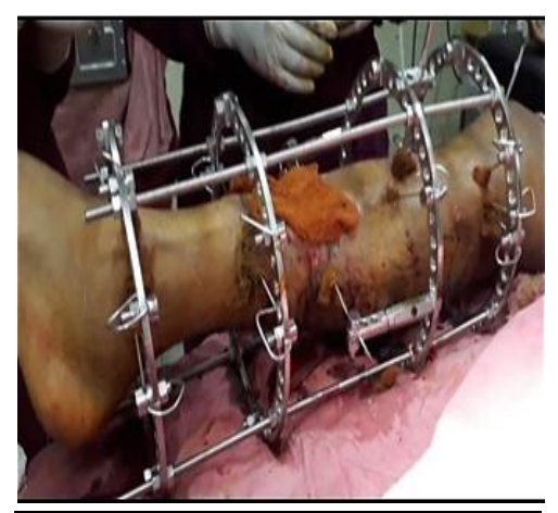
Figure 2. Post-operative image following Ilizarov fixator application

It was followed by active knee and ankle movements.