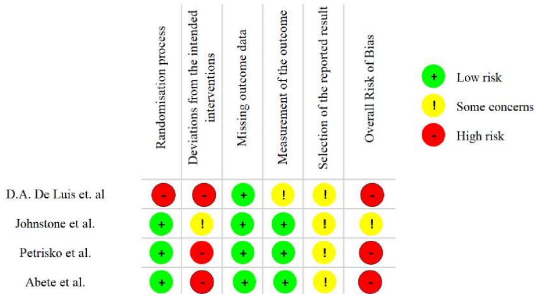
Figure 2. Risk of Bias

BMR as adjusted for physical exercise, dietary studies should calculate BMR via indirect calorimetry as recommend by other studies. 26, 33 Providing individualized diets through indirect calorimetry may have also solved the confounding bias present in all studies with a wide age range of participants (Table 3), the wide age range is deemed a confounding bias as BMR decreases linearly with age. 34 Furthermore, all participants had voluntarily signed up to be in all these studies, which meant that these were obese adults who were motivated enough to start dieting, which may prove less external validity of studies as obese adults in the general population may not be as motivated to diet and therefore possibly have different retention rates to the obese participants in these studies. Finally, the internal validity of the studies presented in this systematic review is low as a result of non-individualized caloric intakes, high risk of biases within studies (Figure 2), different dietary compositions and other aforementioned confounders. Studies with