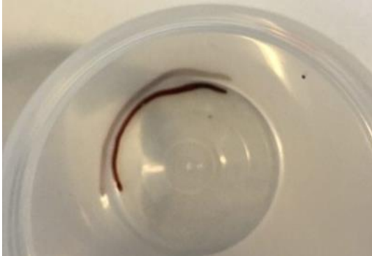
Fig. 2: The whole worm in the plastic glass

parents were also stool examined and they were negative for eggs or larvae of the parasite.