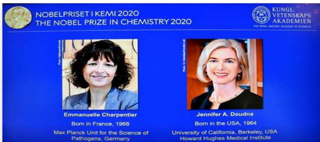
Fig. 1: Emmanuelle Charpentier (Max Planck Institute, Berlin, Germany) and Jennifer Doudna (University of California, Berkely, USA) share the 2020 Nobel chemistry prize for their discovery of gene-editing technique. After reference (1)

and Jennifer A. Doudna for their discovery of “a gene editing technology” (Fig. 1).