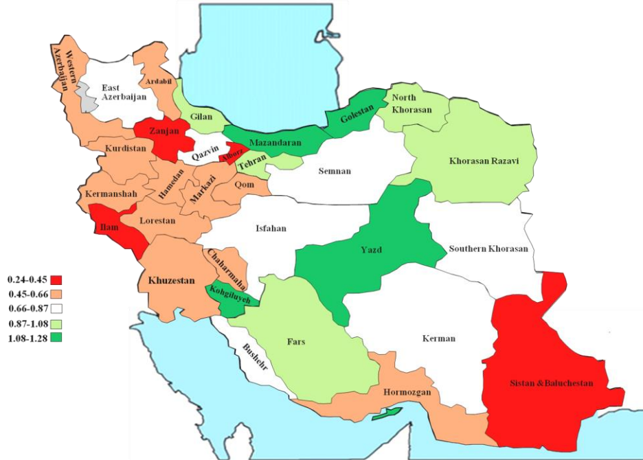
Fig. 1: Provincial Distribution of GPs to Population Ratio (1,000) in provinces of Iran

Markazi, Hormozgan, and Kurdistan which are in fact small and disadvantaged provinces of the country (Table 3).