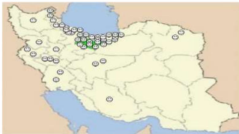
Fig. 1: Distribution of fascioliasis patients in different provinces of Iran

The protocol was approved by Tehran University of Medical Sciences, Ethics Committee (No code: 31382).