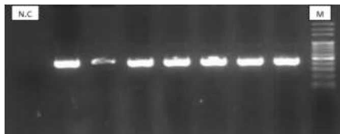
Fig. 3: Nested PCR pattern of fascioliasis patients (negative for egg, positive for antibody). Lane 1: Negative control, Lane 2,3,4: Stool sample, Lane 6,7,8: Urine sample, Lane 9: Positive control, Lane 10: 100bp DNA ladder

The temperature profile for both rounds of amplification was as follows: an initiation 95 °C for 5 min, followed by 30 cycles of 94 °C for 30 sec (denaturation), 60 °C for 30 sec (annealing), 72 °C for 30 sec (extension) and a final extension at 72 °C for 5 min followed by cooling at 4 °C. 5µL aliquot of nested PCR product was electrophoresed on 1.5% agarose gel and visualized using ultraviolet light after staining with Simply Safe (Eurx, Cat. No. E4600-01) (Fig. 3).