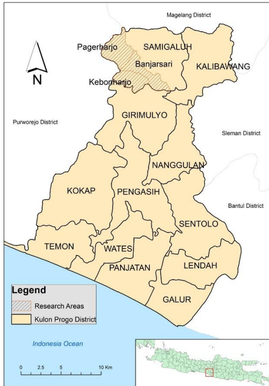
Fig. 2: Research Areas, which were consisted of 3 villages: Pagerharjo, Banjarsari and Kebonharjo, Samigaluh, Kulon Progo, Yogyakarta Province, Indonesia

A structured questionnaire, checklist, and Geographic Positioning System (GPS) were used to collect the data. A questionnaire was established by the researcher based on literature review then tested on 30 people who were not included in our sample with 0.675 Cronbach's Alpha. Questionnaire divided into two sections: First was general questions (Name, Sex, Age, Address, and Occupation). A second part was multiple choice questions related to malaria prevention such as habit in using a bed net, repellent, outdoor activity and other risk factors. Checklist was used as guidance when observed the existence of ventilation net, livestock cage, and for writing the coordinate the case and control. For every variable, participants divided into two categories (at risk and not risk) based on their answer.