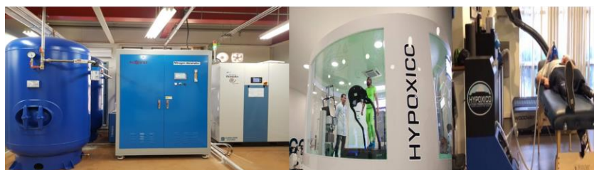
Normobaric hypoxic equipment