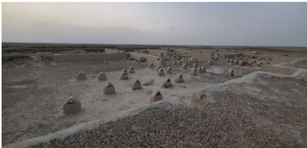
Fig. 6: Shahr-i Sokhta cemetery

Out of 96 adult individuals we studied: 33 are males and 55 are females, 8 individuals were undetermined and all have been determined over 18 years of age. The high number of females compared to males respects the percentage present in the necropolis as confirmed by recent studies (32). Due to the significance of these lesions on bones, scientists have worked on grading these