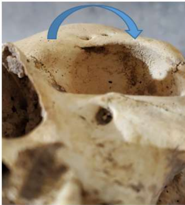
Fig .7: Signs of Co . This skeleton was discovered in 2005 during the excavation of the burnt city (trench number HYA 10; burial number: 5603). The holes present on the orbital roof of this skeleton can indicate traces of anemia during its life.