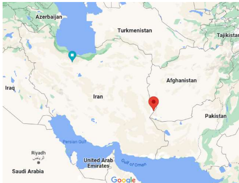
Fig. 5: The location of Burnt City in eastern Iran