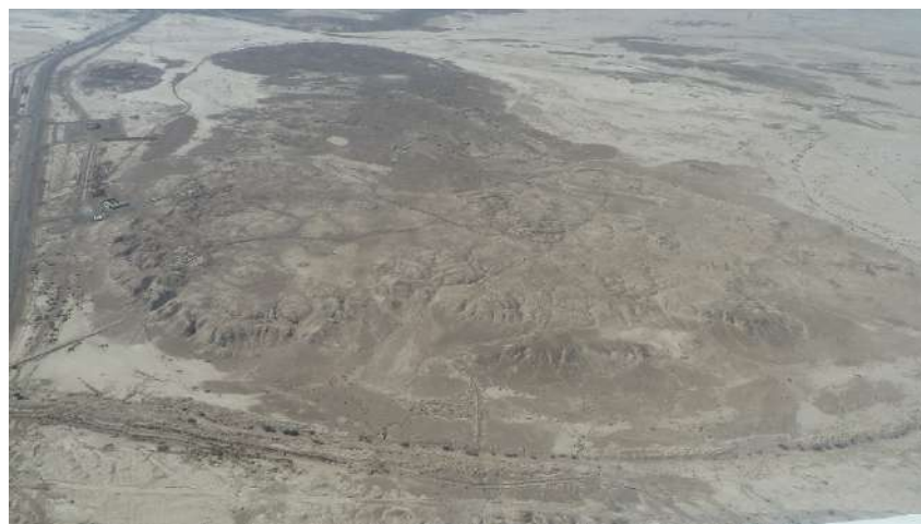
Fig. 4: Aerial photo of Shahr -i Sokhta

main chronological periods. The graveyard, separated from the residential areas, consists of about 25 ha, which could be considered among the largest cemeteries of the ancient world. The dating has been done according to the styles of pottery in the burials. The pottery styles correspond to the four periods that have been identified within the site and that have been dated in this way (31). The research was done on the archaeological data collected during the MAIPS (Multi-disciplinary Archaeological Italian Project at Shahr-i Sokhta) expeditions at Shahr-i Sokhta (2017–2021) kept at the storage of the excavated materials on the site.