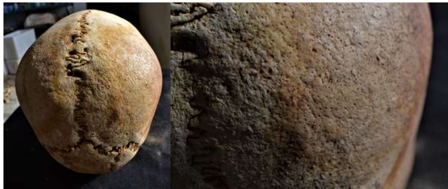
Fig. 3: Signs of Cc. Skull with Cc. Porotic hyperostosis is consequent in the diploic layer's hypertrophy and cortical tissue thinning due to increased red blood cell production activity induced by the anemic conditions (burial number 9606). Cc and Co are external manifestations of Ph.