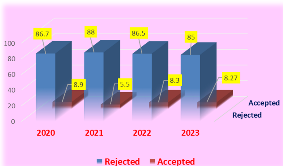
Fig. 2: The percentage of acceptance and rejection rate during 2020-23.