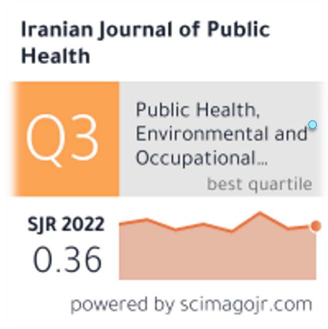
Fig. 4: Key Indicators announced by Scimagojr.com for the year 2022.