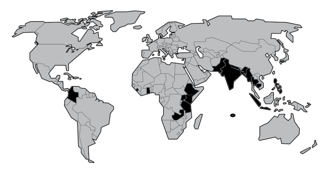
Fig. 3: Geographical distribution of SA studies