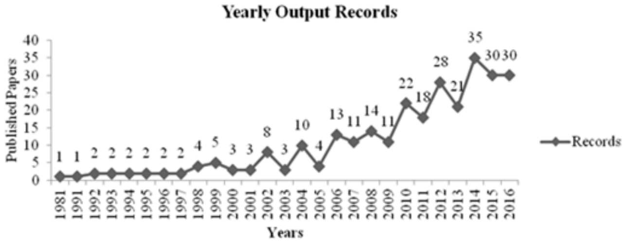
Fig. 1: Distribution of publications on Microscopy / Endodontics (1981-2016)

Source: Own elaboration based on data from Web of Science .