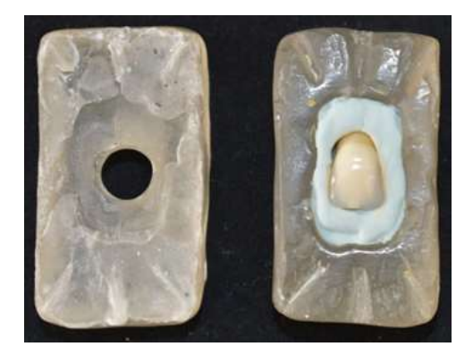
Fig. 1: Transparent acrylic resin mold with a tooth positioned in the central part in silicone material

The solutions were refreshed every 3 days and stirred to prevent deposition of particles [12]. A portable spectrophotometer (VITA Easy shade; Compact, Vita Zahnfabrik, Bad Sachingen, Germany) was used to measure the CIE L*a*b* color parameters of the teeth. The initial color of each tooth was measured prior to immersion in the solutions. The immersed specimens were kept in an incubator at 37°C for subsequent measurements at time intervals of 24 h ( \Delta E12), 1 week ( \Delta E13), 2 weeks ( \Delta E14), and 4 weeks ( \Delta E15). The teeth were rinsed with distilled water before each measurement. The device was calibrated prior to each measurement, and the measurements were made three times for each tooth. The mean values were considered as the final value [14,15].