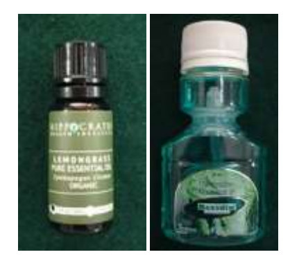
Fig. 1: Lemongrass oil (Hippocrates health institute, USA) and Chlorhexidine mouthwash (Rexidin, Warren, Indoco Remedies Ltd, Mumbai, India)