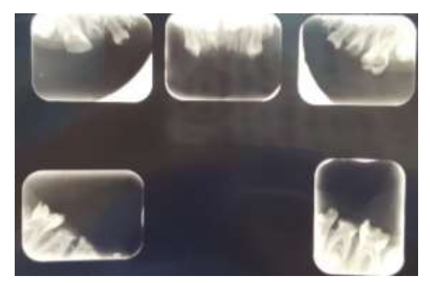
Fig. 3. Pretreatment periapical radiograph of the anterior and posterior teeth

She was then discharged since she had no problem or complication following the general anesthesia and dental treatments.