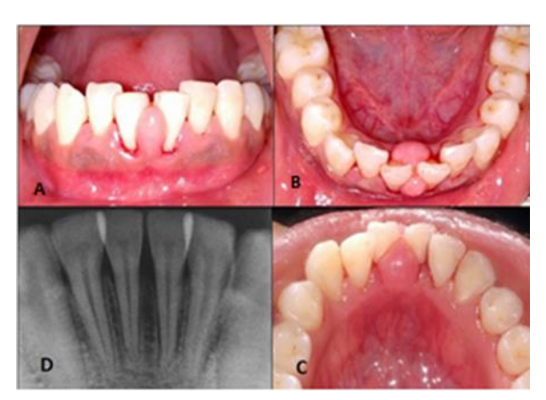
Fig. 1. (A) Preoperative labial view of solitary, pedunculated, pale red mass involving the papilla between the mandibular central incisors; (B) preoperative occlusal view; (C) preoperative lingual view; (D) no significant change seen on periapical radiograph

Intraoral examination revealed generalized chronic gingivitis and a solitary, exophytic, pedunculated, pale red mass involving the papilla between the mandibular central incisors protruding on the labial as well as the lingual aspect (Figs. 1A, 1B and 1C). On close observation, the lesion's surface was found to be irregular, much like the stippling on the attached gingiva. On palpation, it was found to be firm in consistency. Radiographic examination did not reveal any significant change (Fig. 1D). A provisional diagnosis of peripheral ossifying fibroma was made on the basis of history and clinical features.