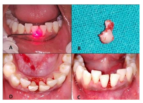
Fig. 2. (A) Excision of the lesion using diode laser; (B) excised tissue; (C) intra-operative labial view; (D) intra-operative occlusal view. The wound was left open for healing by secondary intention.

consent was obtained for excisional biopsy with diode laser. Topical anesthetic gel (2% benzocaine) was applied over and around the lesion. Excision was performed using a diode laser with 980 nm wavelength with an initiated tip with 320 \mu m diameter (FONA Laser, Sirona Dental Systems GmbH, Germany) in chopped mode (duty cycle of 50%, frequency of 20 Hz) at 1.5 W average power (Fig. 2A).