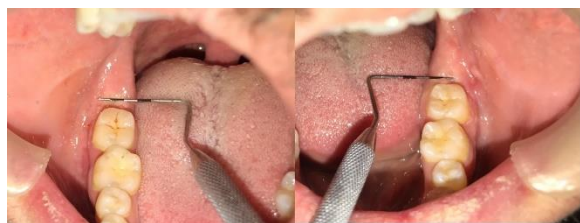
Fig. 1. Dehiscence was measured and its maximum value was recorded

Dehiscence is defined as a distance between the lingual and buccal mucosa. Dehiscence was measured using a Michigan O probe with Williams markings (1, 2, 3, 5, 7, 8, 9, 10 mm; Hu-Friedy Instrument Co., Chicago, IL, USA), and its maximum size was recorded (Fig. 1) [20,22].