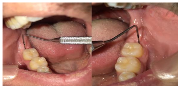
Fig. 2. Periodontal parameters (PPD and CAL) were measured at distobuccal point of the adjacent second molar tooth

CAL is defined as the distance between the cemento-enamel junction (CEJ) and the depth of the pocket expressed in millimeters (mm). Periodontal parameters (PPD and CAL) were measured at the distobuccal point of the adjacent second molar tooth (Fig. 2).