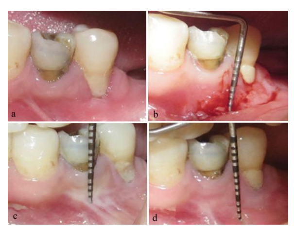
Fig. 3. Mucograft: (a) Before surgery. (b) 30 days after surgery. (c) 90 days after surgery. (d) 180 days after surgery

The width of keratinized gingiva was evaluated using a UNC-15 probe in millimeters and recorded preoperatively and at intervals of 1, 3, and 6 months after surgery. Because one person performed both interventions, the obtained data were correlated, and two-way repeated-measures ANOVA was used. P-values less than 0.05 were considered significant. The difference in keratinized gingival width between two groups of FGG and CM was statistically significant, regardless of the intervention time. It should be noted, however, that in the CM group, the keratinized gingiva was less than that in the FGG group. The mean dimensional change of keratinized gingiva 6 months postoperatively was 4.1±0.7 mm for FGG and 8±1.7 mm for CM (Fig. 2 and 3).