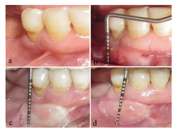
Fig. 2. Free Gingival graft: (a) Before surgery. (b) 30 days after surgery. (c) 90 days after surgery. (d) 180 days after surgery