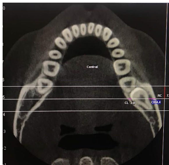
Fig. 6. Central section showing the distance between the anterior and posterior points (white lines). RC was 7 mm, the buccal bone thickness (CB) was 4.4 mm and the lingual bone thickness (CL) was 2 mm.

Total buccal bone thickness (TB) = AB + MB + PB + SB + CB + IB