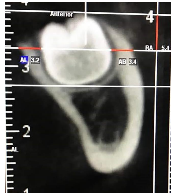
Fig. 5. Measurement of the alveolar bone thickness. As shown, a horizontal line was drawn from the point RA (white line). Red line at the buccal indicates the buccal bone plate (AB) and its thickness was measured to be 4.3 mm. Red line at the lingual indicates the lingual bone plate (AL) and its thickness was measured to be 3.2 mm.

The same was performed in the middle section, and the buccal bone plate in this section was referred to as MB and the lingual bone plate in this section was referred to as ML. Similar measurements were made in the posterior section as well (PB and PL) and on