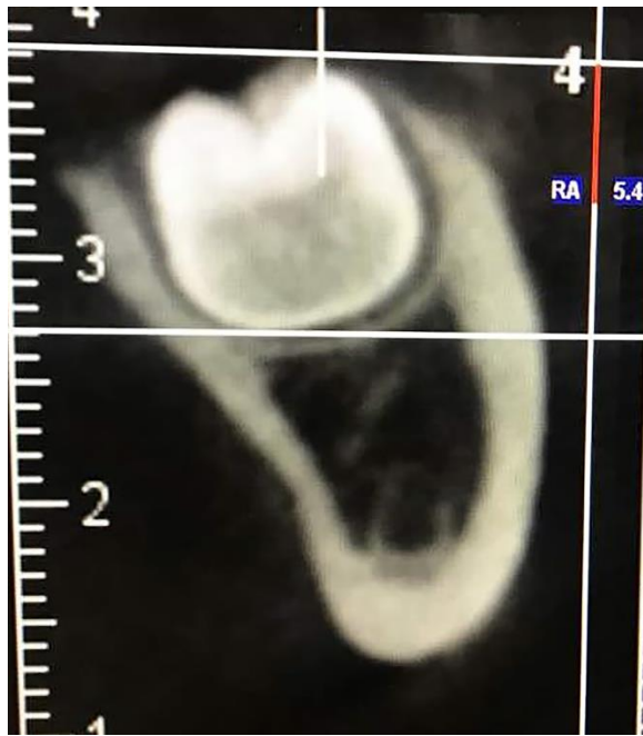
Fig. 4. Anterior CBCT section of impacted third molar. The two white lines indicate the distance between the superior and inferior points and the distance between the two lines was measured to be 10.8 mm. This distance was divided by 2 and the obtained value was 5.4 mm (red line), referred to as RA.

Next, the midpoints were identified right in the middle of the distance between the inferior-superior borders of tooth on cross-sectional slices at the middle, inferior and posterior lines and were referred to as RA, RM and RP, respectively (Fig. 4).