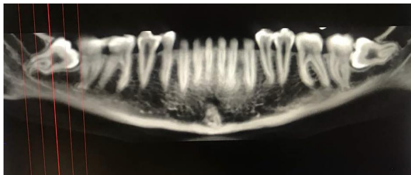
Fig. 1. Identifying the reference sections on a reconstructed panoramic image

The three dividing lines at the middle were considered as reference and referred to as the anterior, middle and posterior lines. Cross-sectional slices were made at each line, and the respective measurements were made on these sections (Fig. 2).