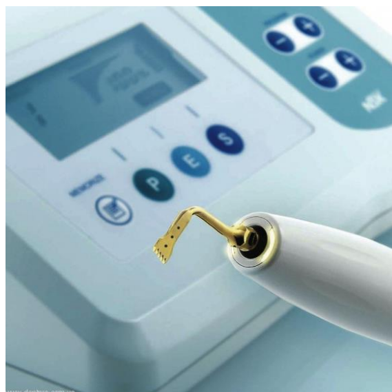
Fig. 1. Ultrasonic Bone Surgery System (VarioSurg, NSK, Tokyo, Japan)

The bonded brackets were incorporated into a stainless steel or nickel-titanium (Ni-Ti) wire, depending on the initial crowding, to start the orthodontic treatment. The teeth were maintained in the oral cavity for two months, and thereafter, they were extracted by a periodontist using the Ultrasonic Bone Surgery System (VarioSurg, NSK, Tokyo, Japan) to prevent bracket debonding during extraction (Fig. 1).