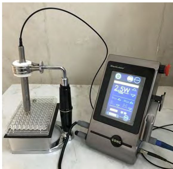
Fig. 1. Laser irradiation of the surface of microplate wells during the treatment of bacteria with antimicrobial photodynamic therapy (aPDT).

polystyrene microplate (TPP; Trasadingen, Switzerland) were filled with 100 \mu l of A. actinomycetemcomitans suspension at the concentration of 1.5 \times 10^8 colony-forming units (CFU)/ml. In groups A and B, 100 \mu l of ICG and 100 \mu l of CS-NPs@ICG were added to the wells, respectively. The microplate was incubated in the dark at room temperature for 5 minutes in a microaerophilic atmosphere. In group C, A. actinomycetemcomitans suspensions were exposed to DenLase diode laser therapy system (China Daheng Group, Inc., Beijing, China) irradiation at the wavelength of 810 nm with an output power of 250 mW and the energy density of 31.2 J/cm 2 . The output power of the diode laser was measured by a power meter (Laser Point s.r.l., Milano, Italy). The probe of the laser was fixed at 1 mm and 3 mm above the top surfaces of the microplate and the bacterial suspension, respectively, by a microphone stand (Fig. 1).