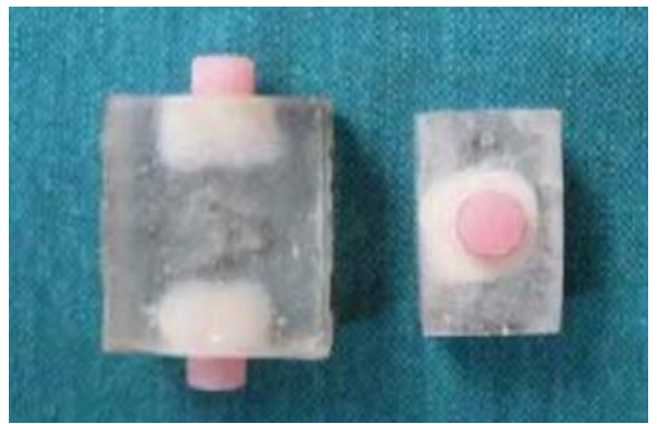
Fig. 2. Samples after removal from putty and cleaning

pressure (100 kg) for 10 minutes and then clamped and cured for eight hours at 74°C as recommended by the manufacturer [19]. After the flask cooled down, the samples were removed and cleaned. The excess acrylic resin was also removed (Fig. 2).