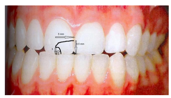
Fig. 1. Specifying the extent and location of white spot lesions

The characteristics of WSLs of each tooth were plotted on a dental chart for each patient by printing a magnified colored image of the lesion and specifying the extent of the lesion and its location for further precise evaluation of the same area (Fig. 1).