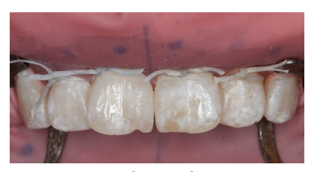
Fig. 2. Generalized white spot lesions in maxillary incisors

Next, the patients received protective glasses. The tooth surface was cleaned with a rubber cup, and OpalDam (Ultradent, South Jordan, UT, USA) was placed to isolate the teeth (Fig. 2). Then, resin infiltrant (Icon, DMG, Hamburg, Germany) was applied according to the manufacturer's instructions.