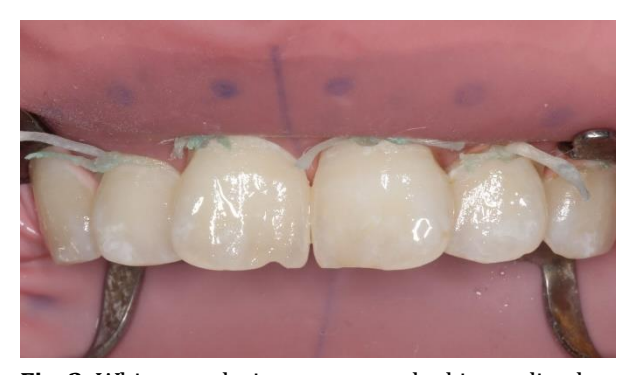
Fig. 3. White spot lesions were masked immediately after resin application

The patients were followed-up for 1, 3, and 6 months after treatment [15-17]. At each follow-up session, standard photographs were obtained for evaluation in Photoshop software, and colorimetry was also performed by using Easy Shade spectrophotometer.