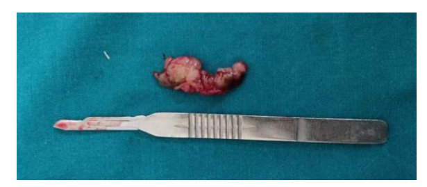
Fig. 6. Excised gingival mass

Secondary healing was achieved by 3 weeks and the wound healed over a period of one month. The lesion was removed as one large mass with few small pieces. (Figure 6)