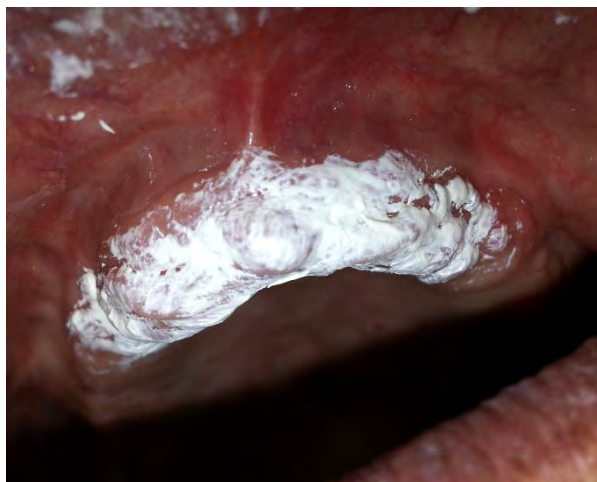
Fig. 1. Flabby tissue in the anterior maxillary region

A 51-year-old male patient visited the Postgraduate Department of Prosthodontics, Saraswati Dental College, Lucknow, with the chief complaint of an ill-fitting upper denture since 2 years previously. The patient had a history of wearing a denture for the past 10 years. The patient was hypertensive and on the same medication since 8 years previously. The intraoral inspection revealed a flabby maxillary canine-to-canine region (Fig. 1) and a severely resorbed mandibular ridge. A treatment plan was designed for fabricating a complete denture with a modified impression technique, causing minimal displacement of the denture during function with maximum retention and stability.