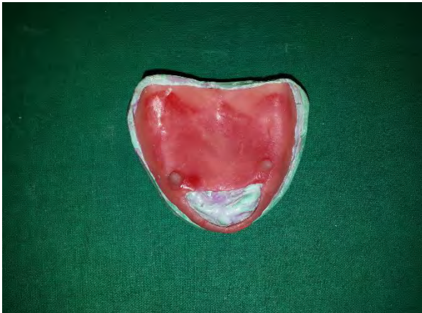
Fig. 3. Second tray with mesh and two holes for positioning into the post

was used as the final impression material on the first tray with a window in it. The second tray with aluminum mesh was placed over the first tray, and light body polyvinylsiloxane (Aquasil ultra, Dentsply) was injected into the mesh. Light body polyvinylsiloxane was used as the final impression material for the second impression as it causes the least displacement of tissues. Both trays were removed together after the impression material had polymerized (Fig. 3).