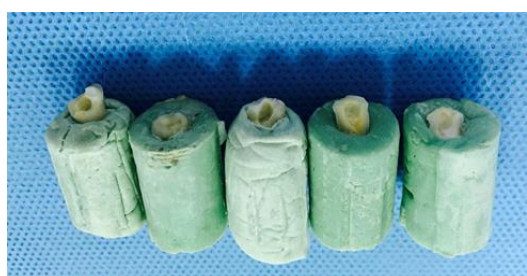
Fig. 3. Repairable fracture (above the CEJ)