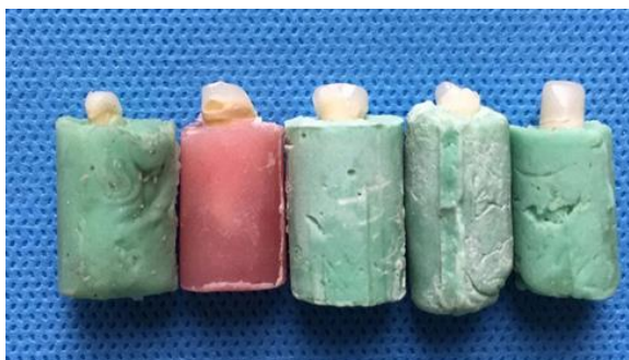
Fig. 4. Irreparable fracture (below the CEJ)