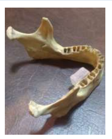
Fig. 1. The phantom used for imaging

The phantom used in this study was comprised of a dried human mandible, and a 2 \times 1 \times 1 cm epoxy resin block was fixed to the lingual side of right mandibular molars using wax. During imaging, the mandible was placed inside an epoxy resin ring to simulate soft tissue (Figure 1).