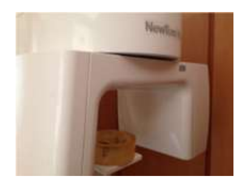
Fig. 3. Geometric depiction of the detector in relation to the object and projection, when the detector or the source has an angular orientation

In each unit, the standard exposure parameters recommended by the manufacturer were used. Overall, the scans were made in a single session without moving the phantom (Figure 3). The five evaluated CBCT units and the applied exposure parameters are listed in Table 1.