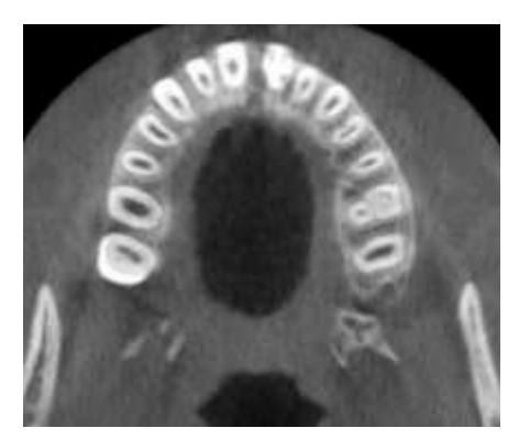
Fig. 4. Axial view of the CBCT showing bone resorption adjacent to the tooth #9.

Considering these findings, a CBCT was prescribed in order to facilitate an accurate diagnosis. Although no obvious root fractures were observed in the CBCT, the bone resorption pattern adjacent to the root area suggested a root fracture (Figure 4).