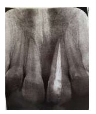
Fig. 3. Periapical radiography six months after the traumatic injury shows j-shaped radiolucency in the mesial aspect of the tooth #9.

Intra-oral examination revealed an abscess located in the attached gingiva above the tooth #9 (Figure 1). There was a history of dental trauma six months ago, which had resulted in crown fracture of the tooth #9 (Figure 2). The tooth had received root canal treatment and direct composite restoration at that time by the previous dentist. All the anterior teeth responded normally to thermal sensibility tests, except tooth #9, which was unresponsive. Both maxillary central incisors were tender on percussion and palpation. Based on periodontal examinations, tooth #9 showed a pocket depth of 12mm and mobility of grade 2, while these values were within the normal range for the other anterior teeth. The occlusal contacts of the anterior teeth were examined with a carbon paper, and it was found that tooth #8 had a premature and traumatic contact in centric relation. A periapical radiograph was taken and showed a halo or "J "shaped radiolucency around tooth #9 (Figure 3).