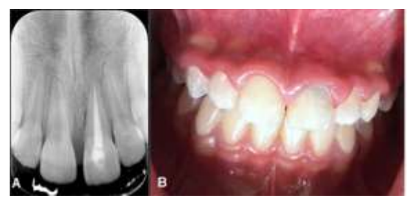
Fig. 7. Six-month follow-up. (A) Radiograph shows formation of lamina dura and bone formation in the affected areas. (B) Normal gingival tissue and absence of sinus tract are evident.

If the sound dentin is below the gingival level, crown lengthening surgery, orthodontic extrusion or surgical extrusion can be considered as treatment options in order to expose the dentin and provide an environment for placement of a well-sealed restoration [2]. However, crown lengthening surgery for a single tooth in the aesthetic zone may result in gingival margin discrepancy. Also, in the cases of incomplete crown-root fracture, as the exact extension of the fracture cannot be determined through clinical and radiographic examinations, it is not possible to define to what extent the extrusion should be performed. When the crack has extended extremely apically, the prognosis of the tooth is considered poor because of extensive periodontal and/or periapical involvement and bone loss. Thus, extraction is suggested as a primary treatment option [9]. In recent years, several case reports and case series are