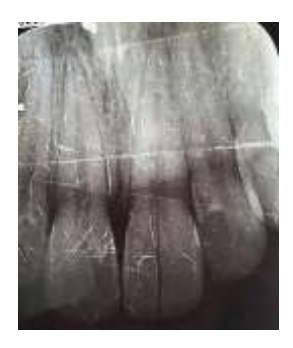
Fig. 2. Radiograph obtained after the traumatic injury showed vertically oriented crown-root fracture

A healthy 12-year-old female with noncontributory medical history was referred to the Endodontic Department with a chief complaint of dental abscess.