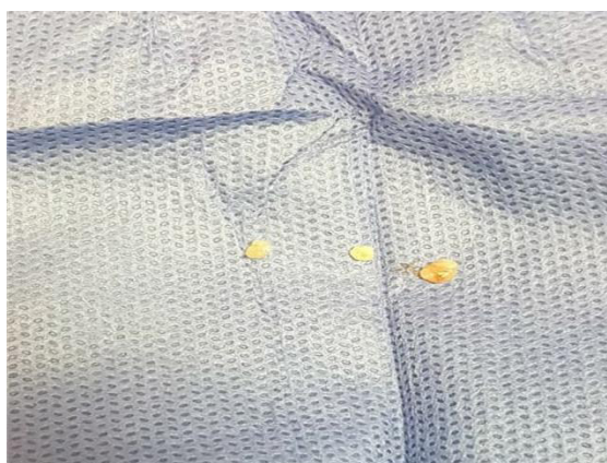
Figure 1. Radiodermatitis of scalp with skin atrophy, hair loss, scars of previous tumor surgery along with numerous small, firm, skin-colored nodules on the vertex area

The reported cases of osteoma cutis of the scalp are plate-like form [5] or miliary osteoma cutis [1, 4]. Based on the literature review, our patient is a rare case of os-