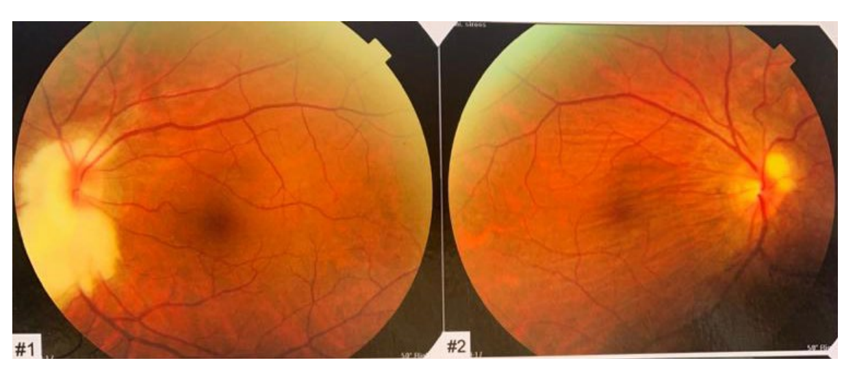
Fig. 1. fundus photograph

During the eighth month of pregnancy, the myelination of the visual pathway travels anteriorly from the lateral geniculate body (LGB) to the globe, terminating postnatally at the level of the lamina cribrosa. The lamina cribrosa prevents oligodendrocyte progenitor cells from migrating, causing the myelination process to stop at this level. MNFL has aberrant retinal ganglion cell histology and fewer retinal ganglion cells overall compared to nearby locations. Within the myelinated retinal patch, there is no evidence of inflammation. The retina surrounding a myelinated RNFL patch is normal. Retinal myelination can be acquired under specific circumstances, such as surgical procedures (optic nerve fenestration) or optic nerve abnormalities (optic disc drusen and chronic papilledema). Additionally, MNFL regression has been linked to conditions such as multiple sclerosis, glaucoma, retinal artery occlusions, and Behçet's disease. MNFL should be distinguished from other diseases because it is a