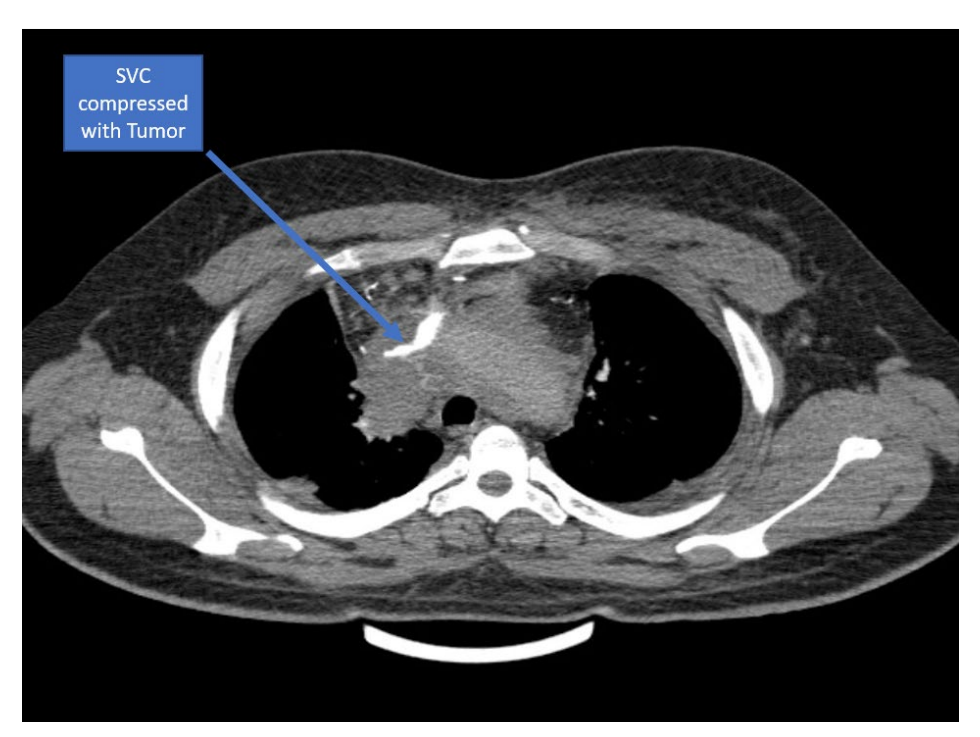
Fig. 2. SVC compression with tumor, contrast enhanced CT scan