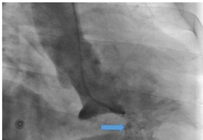
Figure 3. Right anterior oblique view of left ventricular angiography, showing a diverticulum in the posterobasal wall (arrow)

Coronary artery angiography showed normal coronary arteries, and ventriculography revealed a narrow-necked outpouching in the posterobasal LV wall with systolic contractions, suggestive of an asymptomatic huge ventricular diverticulum (Figure3). The patient refused to undergo cardiac magnetic resonance imaging despite our recommendation.