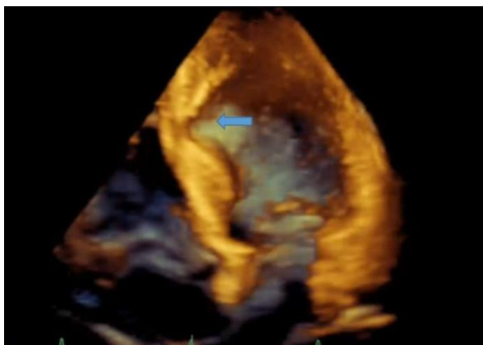
Figure 2. Four-chamber view of three-dimensional transthoracic echocardiography, showing a diverticulum in the mid inferoseptal wall (arrow)

Coronary artery angiography showed normal coronary arteries, and ventriculography revealed a narrow-necked outpouching in the posterobasal LV wall with systolic contractions, suggestive of an asymptomatic huge ventricular diverticulum (Figure3). The patient refused to undergo cardiac magnetic resonance imaging despite our recommendation.