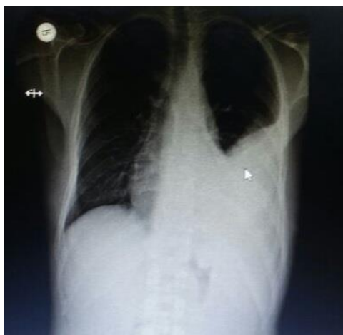
Figure 1. Posteroanterior chest radiography, on admission, shows a consolidated region in the left thoracic cavity (arrow).

In light of the findings, a diagnosis of chylothorax was established. The patient was hospitalized and received single doses of LMWH, 0.5 mg of colchicine, 40 mg of an oral corticosteroid (prednisolone), 2 doses of oral immunosuppressive therapy (50 mg of azathioprine), and a high-carbohydrate and low-fat dietary regimen. A left thoracic drainage system was established for the patient. On the seventh day of hospitalization, due to a progressing cheilosis flow, a pleurodesis process was applied with talcum powder. However, the chylothorax progression continued for the following 3 days. Venous autologous blood (60 mL) was injected into the left thorax via a drainage tube, which was clamped in order to avoid the leakage of the blood back through it. For the ensuing 3 hours, the patient was moved into different lying positions. Two days later, the cheilosis flow decreased to an acceptable level, and the dietary limitations were canceled. At the end of the 15th day following the autologous blood pleurodesis process, the cheilosis flow totally disappeared. The patient was discharged with a treatment of an oral anticoagulant (5 mg of warfarin) and a single dose of an oral immunosuppressive therapy (50 mg of azathioprine). One month after the hospital discharge, no pathology was observed on a posteroanterior direct chest radiogram (Figure 2).