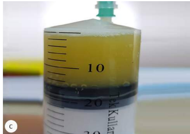
Figure 1. A) Transthoracic echocardiography (parasternal long-axis view), showing fibrinous pericardial effusion (arrows indicate the fibrin). B) Transthoracic echocardiography (parasternal short-axis view), showing the fibrinous pericardial effusion (arrows indicate the fibrin). C) Macroscopic imaging of the purulent pericardial fluid LV, Left ventricle; RV, Right ventricle

The patient underwent urgent echocardiography-guided pericardiocentesis. Totally, 600 cc of purulent pericardial fluid was drained (Figure 1C). Consultations were done with infectious disease specialists, who started an empiric antibiotic treatment with teicoplanin (1×400 mg/d) and meropenem (3×1 g/d). The microbiological culture of the pericardial fluid yielded Candida albicans ; consequently, caspofungin (1×50 mg/d) was added to the therapy. While the patient was on the parenteral antimicrobial therapy, an upper gastrointestinal tract endoscopy and abdominal computed tomography with oral contrasts were performed. There was no gastropericardial fistula, nor was there any leak at the anastomoses. During the follow-up, the patient's laboratory parameters, including the serum creatinine level, returned to normal limits and his urine output became normal. After an echocardiographic follow-up and the completion of 1 month of antibiotherapy, he was discharged from the hospital without any complications. During his follow-up, the patient remained asymptomatic and had no pericardial fluid for 6 months. In addition, no pathological 18 F-FDG (fludeoxyglucose) accumulation was observed on positron emission tomography.