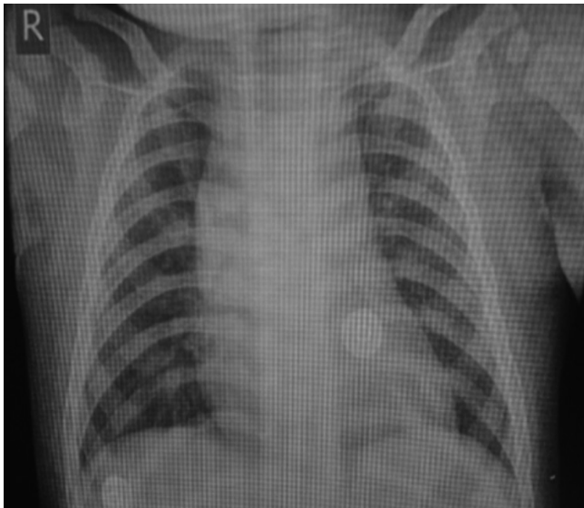
Figure 1. Chest radiography demonstrates an increased cardiothoracic ratio, a prominent right atrium, and pulmonary venous congestion.

A full-term, 3.5 kg male neonate was delivered via cesarean section in a small town. The newborn exhibited cyanosis and respiratory distress immediately after birth and was subsequently admitted to the neonatal intensive care unit and intubated. His heart rhythm was regular, and a loud pansystolic murmur was audible through the precordium upon auscultation. Upon physical examination, the patient exhibited diminished femoral pulses, while brachial pulses were found to be within normal range. The liver edge was palpable 1 cm below the right costal margin, and the pulse rate was 170 bpm. Blood pressure in the upper and lower limbs was 75/50 and 60/40 mm Hg, respectively. A chest X-ray illustrated an increased cardiothoracic ratio and mild pulmonary venous congestion (Figure 1).