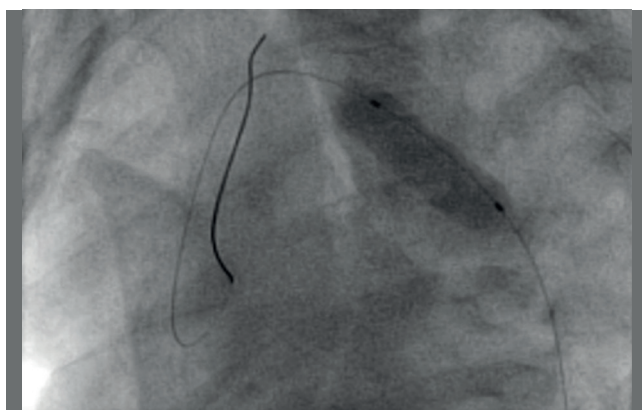
Figure 4. The left anterior oblique view of the aortic root angiogram

displays the successful percutaneous transluminal angioplasty, with the balloon clearly positioned correctly.