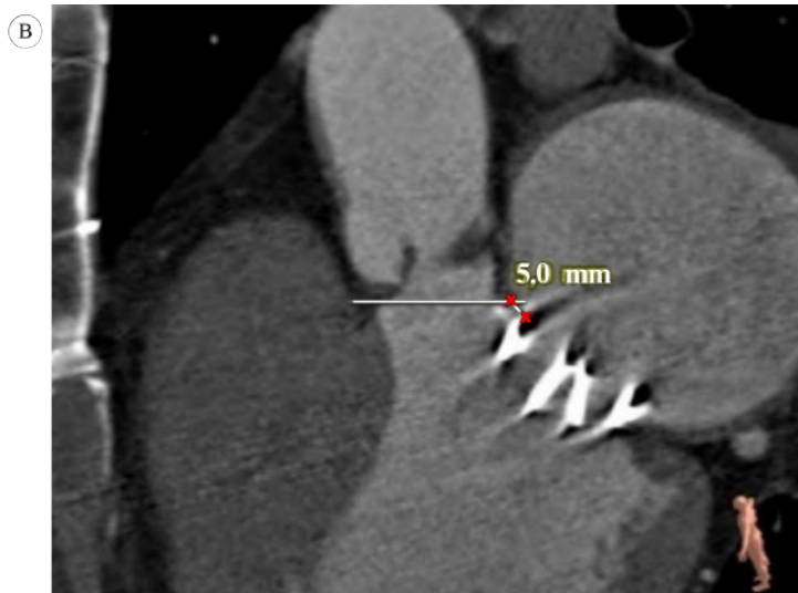
Figure 1. A) Computed tomography images of a calcified aortic valve and aortic annulus with valve sizes; and B) minimum distance between the prosthetic mitral valve and the aortic valve annulus

LVOT, Left ventricular outflow tract; RCA, Right coronary artery; LCA, Left coronary artery