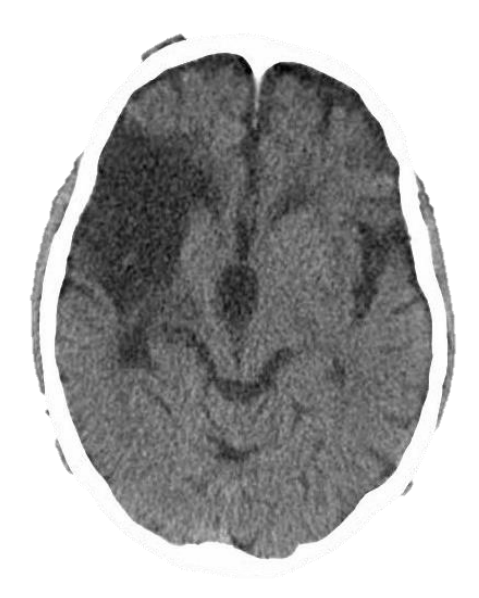
Figure 1. Brain computed tomography (CT)-scan without contrast of the patient

ography (EMG), electrocardiography (EKG), airflow and respiratory effort, peripheral hemoglobin saturation (SpO<sub>2</sub>), and EEG were recorded; sleep stages and arousals were scored according to the American Academy of Sleep Medicine (AASM) criteria (11).