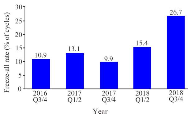
Figure 1. Rate of use of a freeze-all protocol over time (2016–2018): Rate per cycle with follicular puncture

a: Number of cycles in which an in vitro fertilization procedure was performed. b: One or more 2PN stages. c: Among cycles in which at least one oocyte was fertilized. CI=Confidence Interval; n=number of cycles