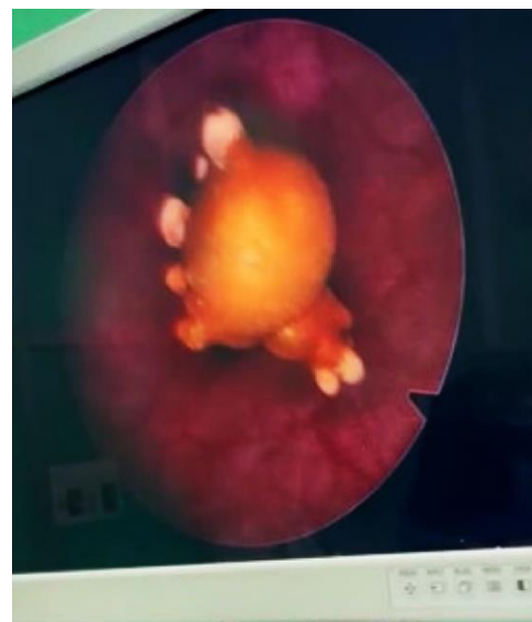
Figure 3. Cystoscopic view of the migrated intrauterine device (IUD)

charged. During the 1-month and 3-month follow-up visits, the patient had no symptoms or complaints.