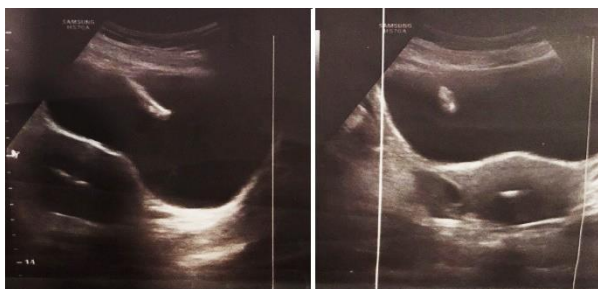
Figure 1. Ultrasound image showing IUD in uterus and bladder

In hysteroscopy, a second IUD was observed inside the uterus, which was removed with a grasper, and the uterine cavity appeared normal. Six hours after the operation, the patient was dis-