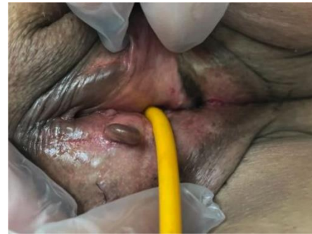
Figure 2. Vulvar endometriosis lesions

ry of four pregnancies and four deliveries and has been in menopause for 10 years. In 2023, according to ultrasound report, the patient underwent diagnostic curettage with immunohistochemistry, revealing a pathological diagnosis of endometrial cancer (endometrioid adenocarcinoma) with positive staining for p16, ER, and vimentin. Subsequently, after one week, she underwent complete surgical staging, including hysterectomy, bilateral salpingo-oophorectomy, cytology, and pelvic lymph node dissection. Following a three-day postoperative hospitalization without complications, she was discharged.