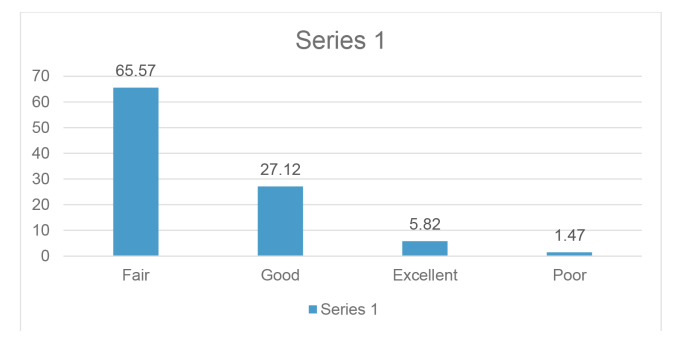
Figure 3. Frequency of documentation of interactions in each class.

Considering reliability rating of interactions, the results showed that 1025 (60.57%) were fair, 424 (27.12%) were good, 91 (5.82%) were excellent, and 23 (1.47%) were poor (Figure 3). Table 2 reports the most common interactions in each class A B C D X.