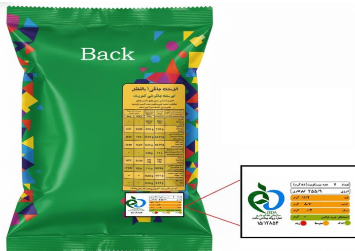
Figure 2. Back-of-package nutrition labeling in Iran.

quality. This score is derived from a calculation that weighs beneficial components (like fiber, protein, and fruit/vegetable content) against detrimental components (like energy, sugar, saturated fats, and salt) per 100 grams or milliliters, thereby resolving complex nutrient trade-offs into a single, easily digestible grade (Julia et al. , 2018). The most vulnerable group to NCDs are individuals with low education, income, or social class; thus, the implementation of a simpler directive food labeling such as Nutri-Score which indicates the overall healthiness of a food, or a combined system such as the health star rating used in Australia, may be a better option rather than the TLL, especially for people with lower educational backgrounds (Di Cesare et al. , 2013, Niessen et al. , 2018). Notably, in a recent study by Pettigrew et al. , which analyzed the effectiveness of five FOP nutrition labels across 18 countries, they found Nutri-Score performed best in terms of both attraction and aversion results for understanding and simulated choice outcomes (Pettigrew et al. , 2023).