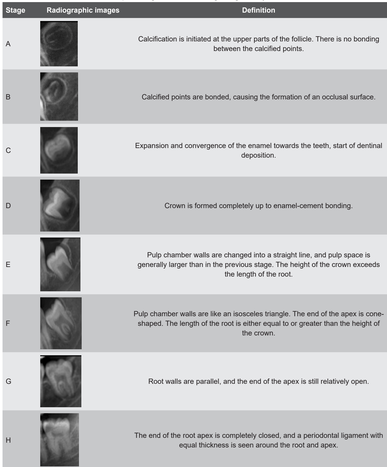
Table 2. Definition of third molar development degree based on the eight-stage Demirjian index

to 0.72 In the multiple regression model, spheno-occipital synchondrosis fusion degree and Demirjian index were considered as independent variables for age estimation. The results of the analysis showed R^2 value was 0.75 (Table 4). In addition, the following